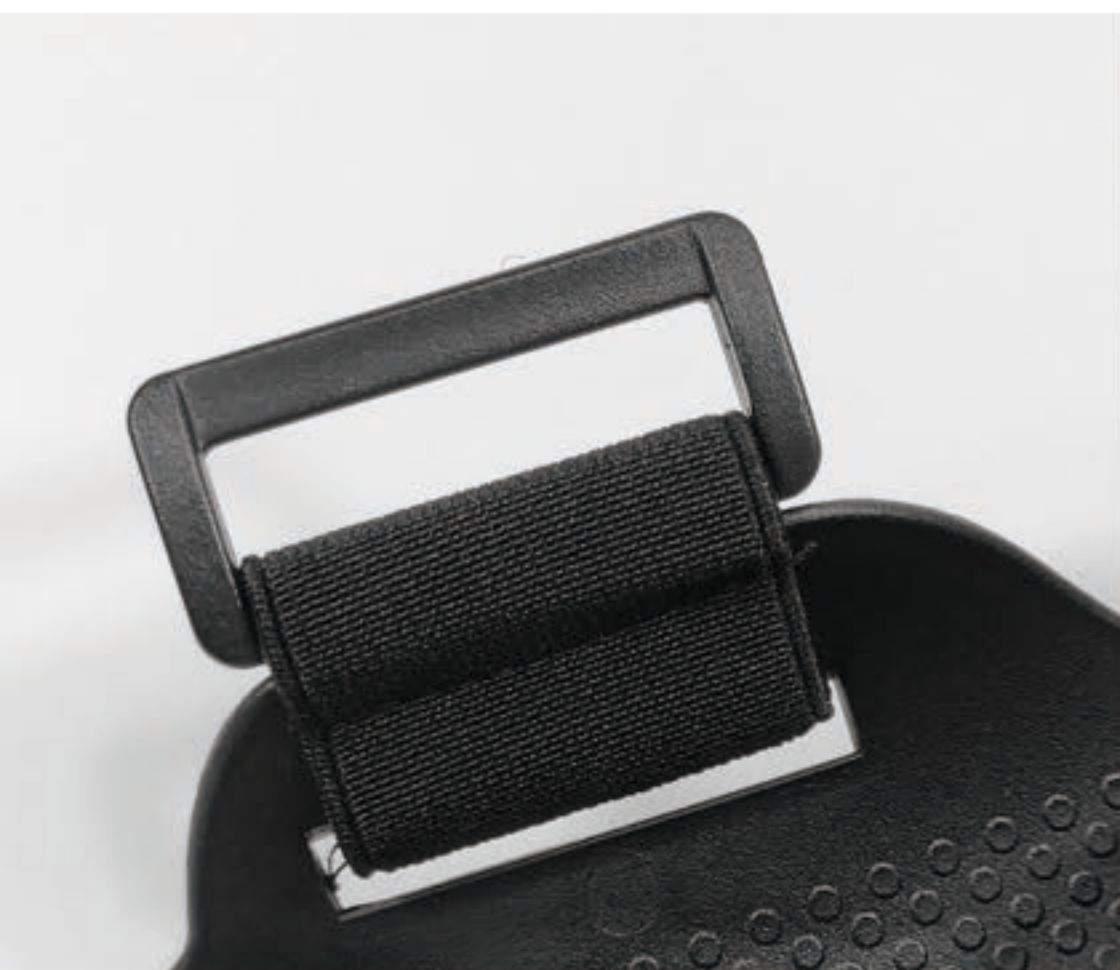
Fixed Square buckle