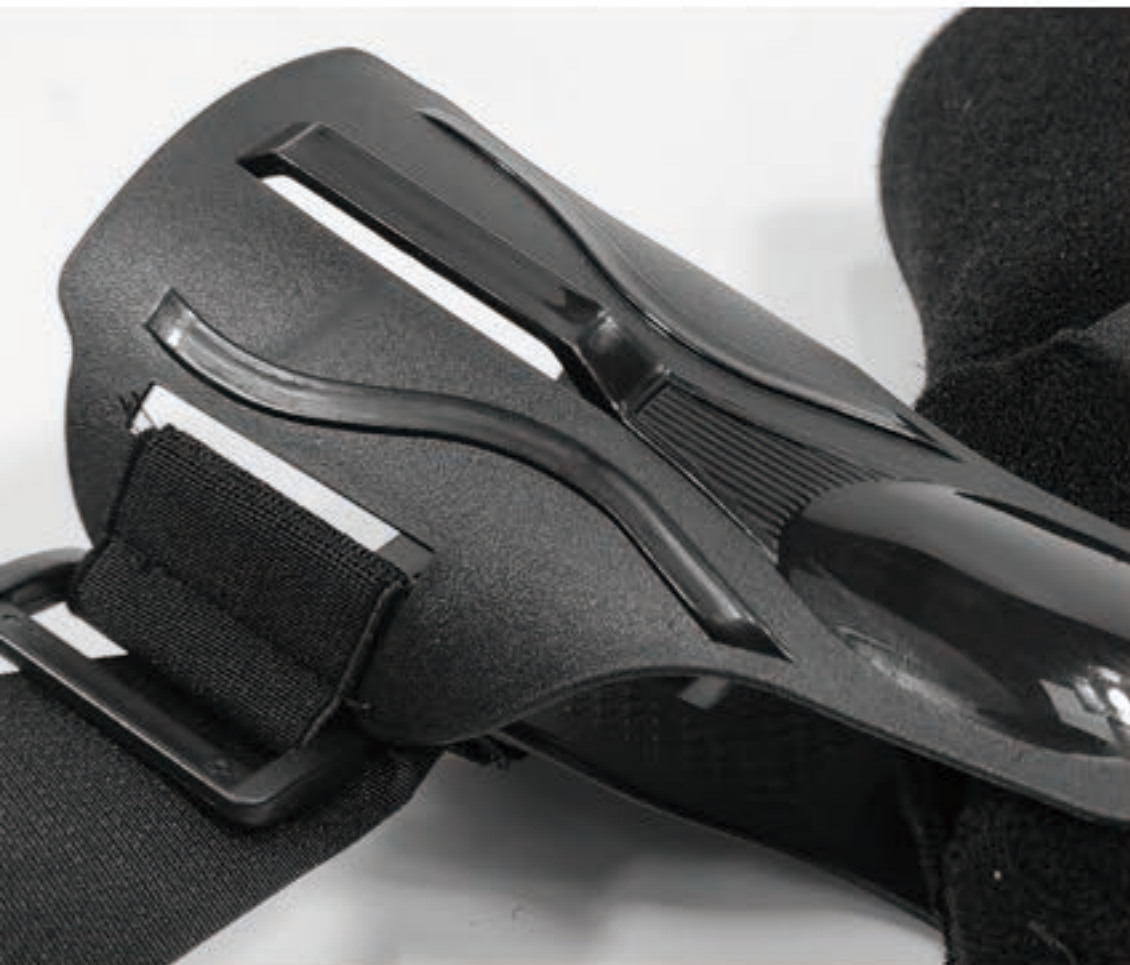
ABS plastic Guard plate