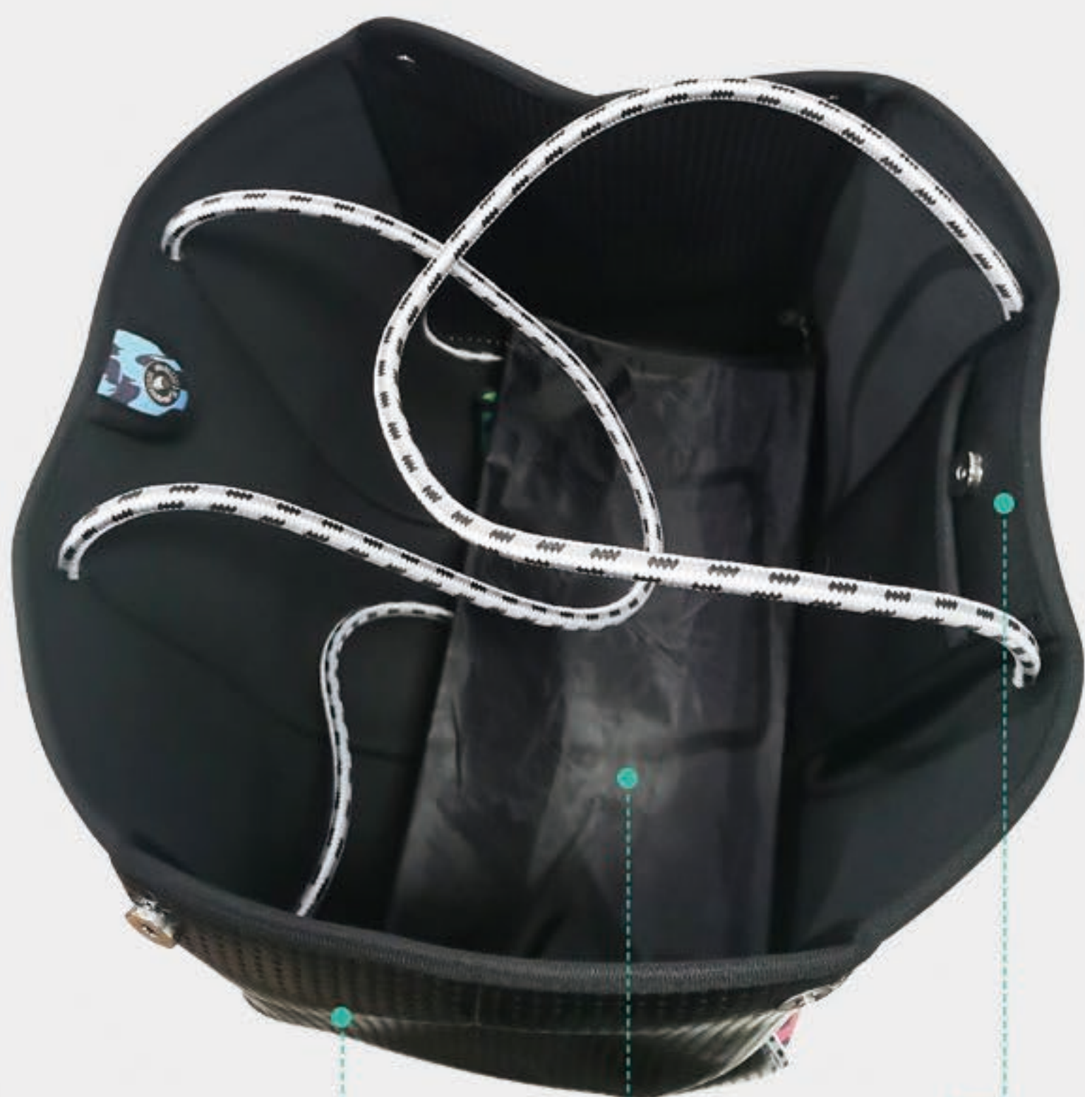
Built-in fixed-shape mobile bulkhead